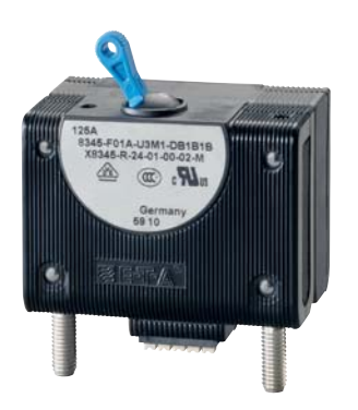
Hydraulic-Magnetic Circuit Breaker Type 8345 + X8345-R (remote ON/OFF actuation module)