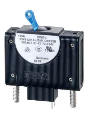
Hydraulic-Magnetic Circuit Breaker Type 8345 + X8345-F (remote trip module)